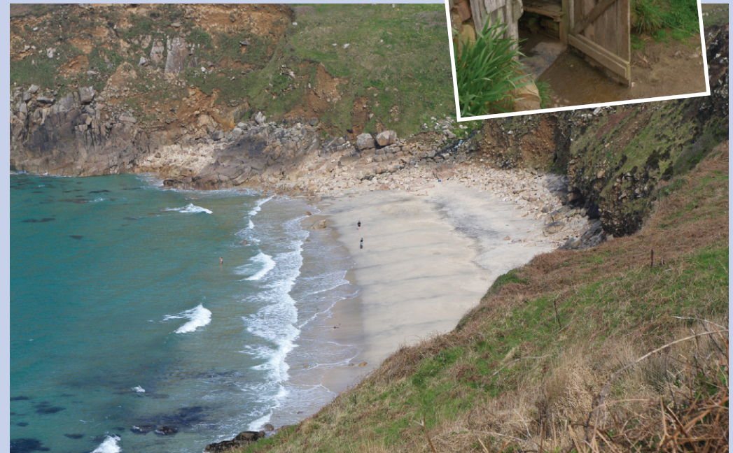
Portheras Cove is well worth the half-mile walk from Pendeen lighthouse. LEE STUTT