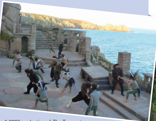
A 2007 production of The Tempest at the Minack Theatre. ROBIN JONES