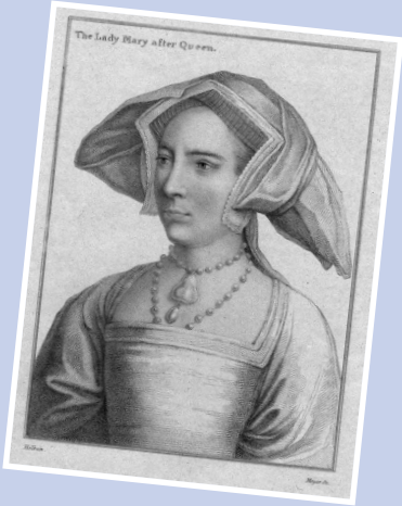
Above: Queen 'Bloody' Mary Tudor by Hans Holbein.