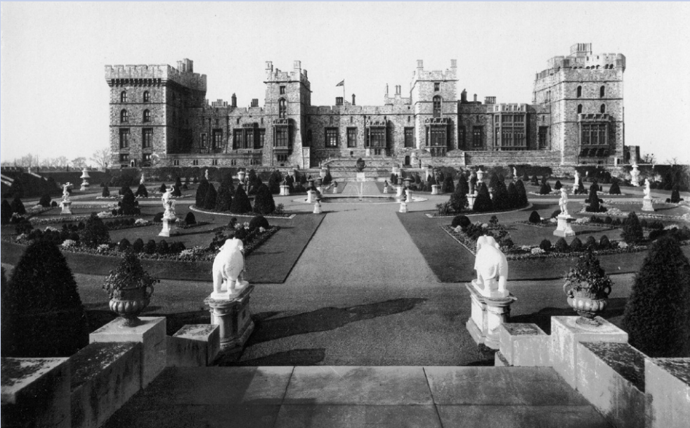
The East Terrace of Windsor Castle – the scene of numerous ghostly sightings c. 1895.