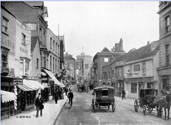
Above: Peascod Street, Windsor c. 1914. ©Royal Windsor Website Right: Malleus Maleficarum – (The Hammer of Witches) used as the handbook for the persecution of witches. Wikimedia Commons