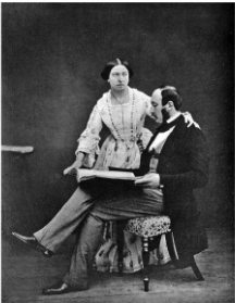
Queen Victoria and Prince Albert 1854.

aspect of her life including state affairs. This has led to speculation that Brown was indeed regularly channelling the spirit of the dead Prince and explains why the couple became so inseparable that she was mockingly referred to as 'Mrs Brown.'