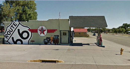
Right: Texaco Station, Tucumari 35° 10' 18.98" N 103° 42' 42.89" W