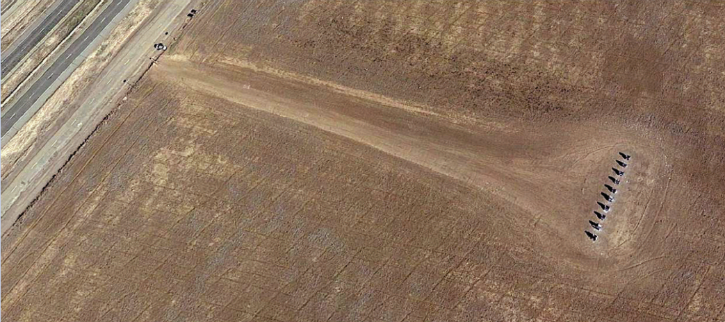
Above: Cadillac Ranch 35° 11' 16.68" N 101° 59' 14.87" W