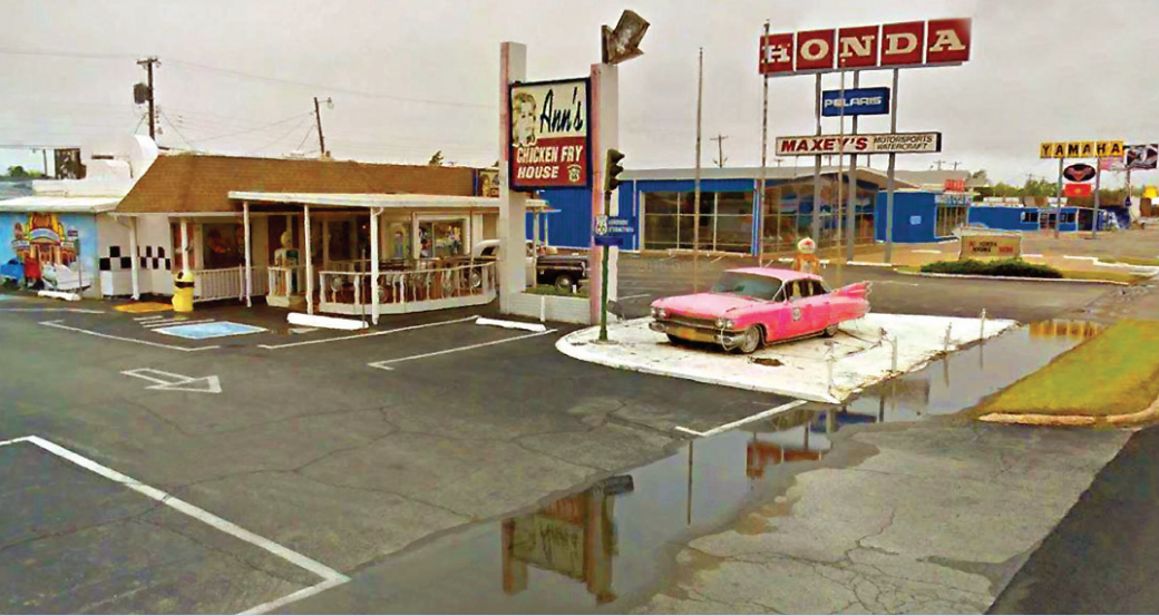
Above: Ann's Chicken Fry House, Oklahoma City 35° 30' 40.03" N 97° 35' 35.08" W