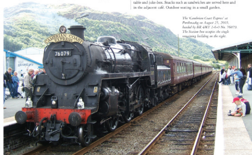
The Cambrian Coast Express at Porthmadog on August 25, 2005, hauled by BR 647 2464 No. 76079. The station here occupies the single remaining building on the right.

local community as well as those who come to the station from another from a further-removed mainly to sports events. The building, which is rather functional but whose interior is decorated with railway photographs, prints and signs, many of which are of local interest. A collection of crabs above the wood-paneled bar relate not to railways but to Army barracks. Royal Navy ships and the police. There is a pool table and juke-box. Snacks such as sandwiches are served here and in the adjacent cafe. Outdoor seating in a small garden.