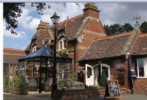
A Midland Railway lamp stands in the garden of The Brampton Hall, an extended former stationmaster's house.

The old stationmaster's house, which is the pub's nucleus, is the only original railway building surviving at this location, dating from around the time of the line's 1859 opening. In red brick with horizontal courses of yellow, and three upper windows set within pointed arches—their crown with delicate finials—are indications that this was home to a railway employee of some rank. He would have taken personal charge of any important or urgent shipments arriving or leaving by train, supervised a staff of at least full-time and come out to meet the main passenger train. Today the original entrance has been sealed and a modern glazed canopy placed in front, for smokers' use, detracting from the look somewhat. Nothing original