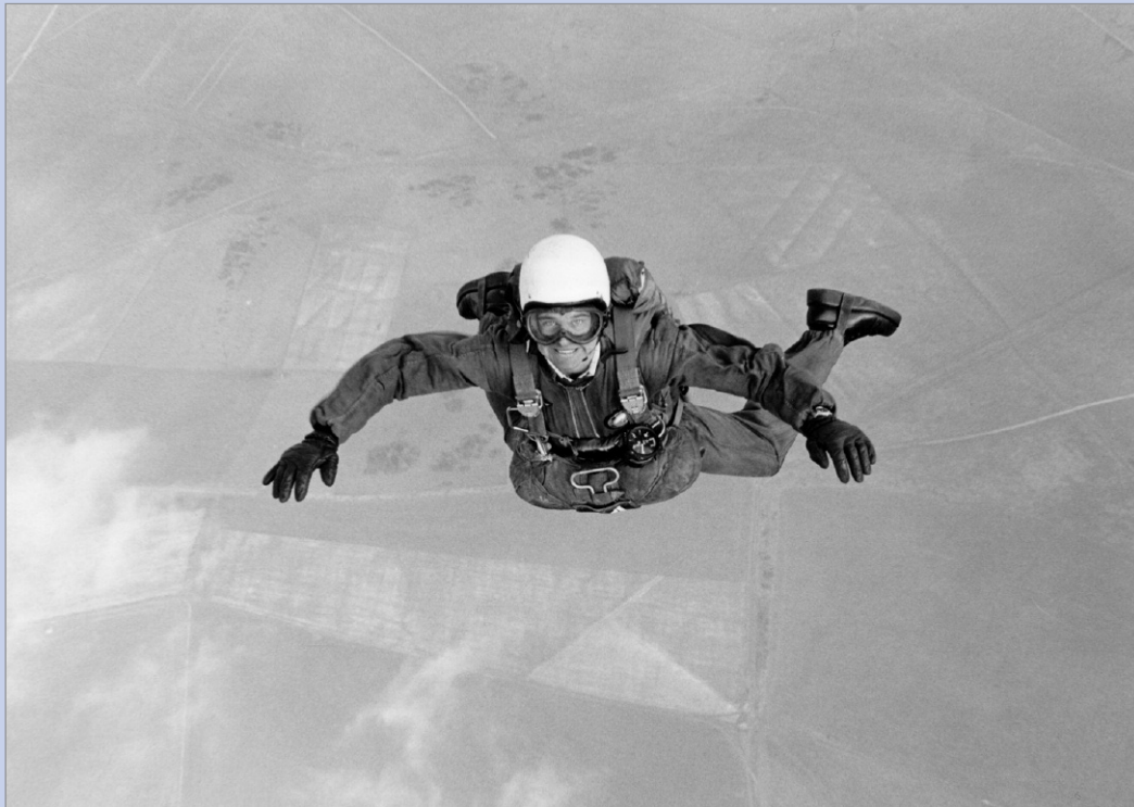
Author in free fall at 4000 ft over Salisbury Plain.