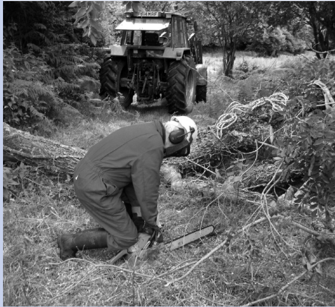
The Author at work.