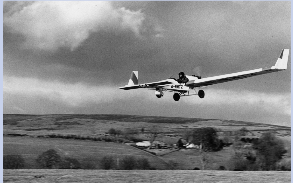
The home-built 'Goldwing' being flown by the author.