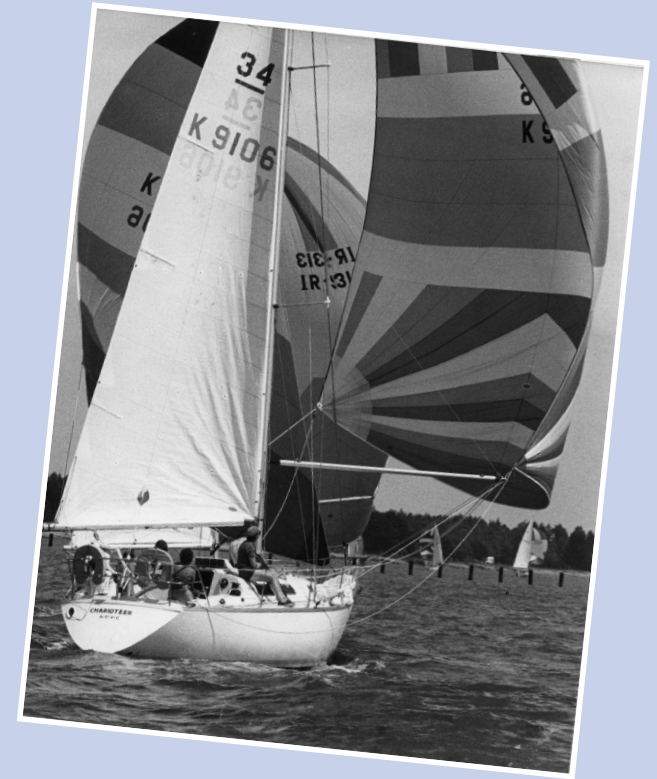
Charioteer lost at sea 1979.