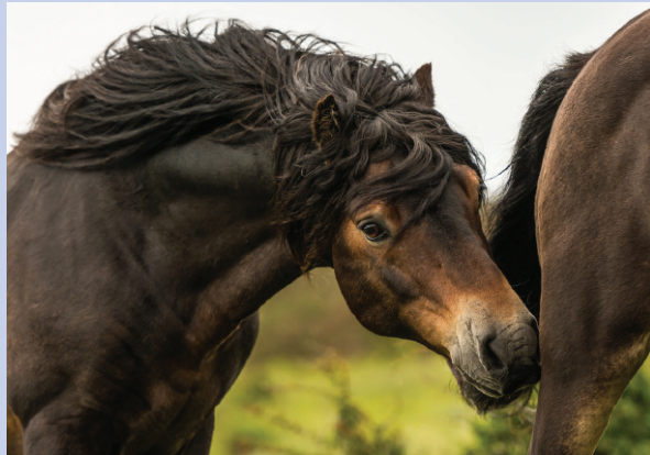
Above left: Being accepted to relax with the herd is a privilege.