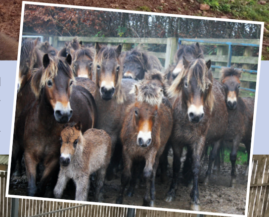
Below: Dawn connecting with the herd.