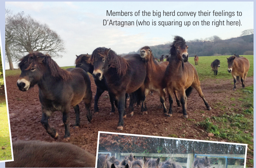
Members of the big herd convey their feelings to D'Artagnan (who is squaring up on the right here).