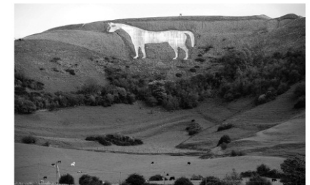
Bratton White Horse, Wiltshire.

chickens, whose carcasses they very often leave lying around, would happily throttle the stinking vermin which Basil Brush in reality is. Yet we love foxes and badgers and would rather throttle the farmer who would kill them to safeguard their own livelihood.