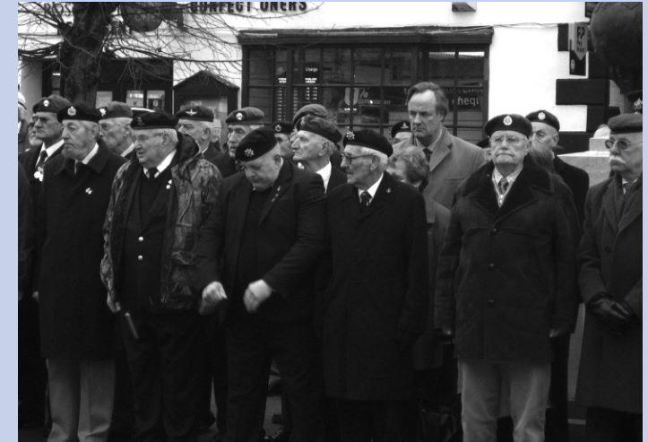
Above: Royal Wootton Bassett Repatriation.