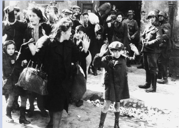
Above: Warsaw, Poland.