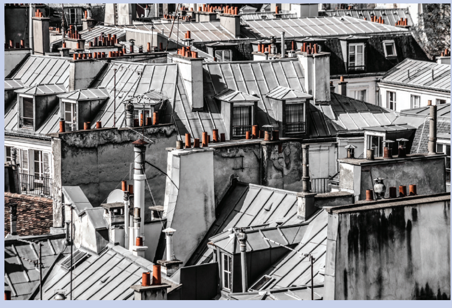
Rooftops, Paris, France