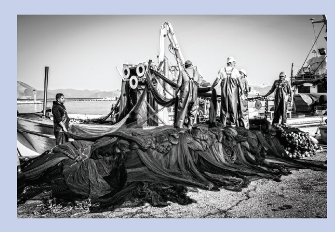
Right: In the Villages 2 Corfu, Greece