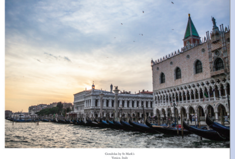
Opposite: The Last Gordol Vanica, India