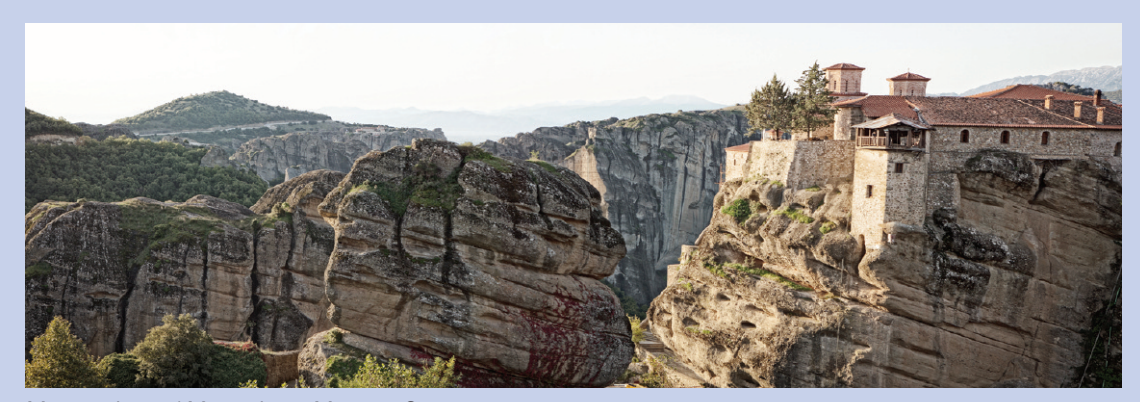
Monasteries and Mountains 5, Meteora, Greece