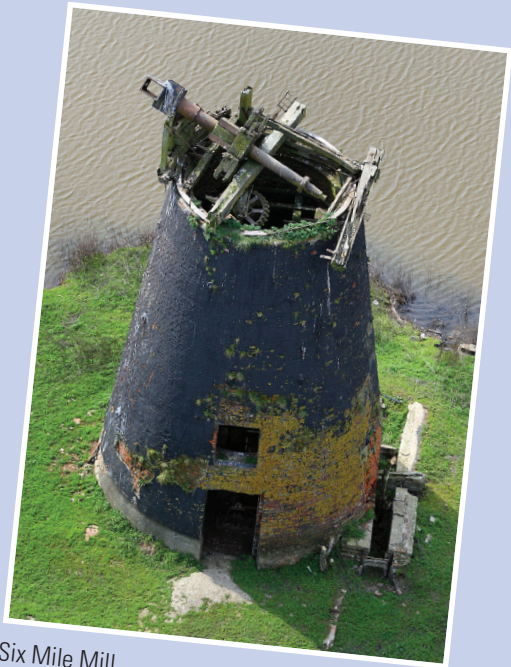
Six Mile Mill