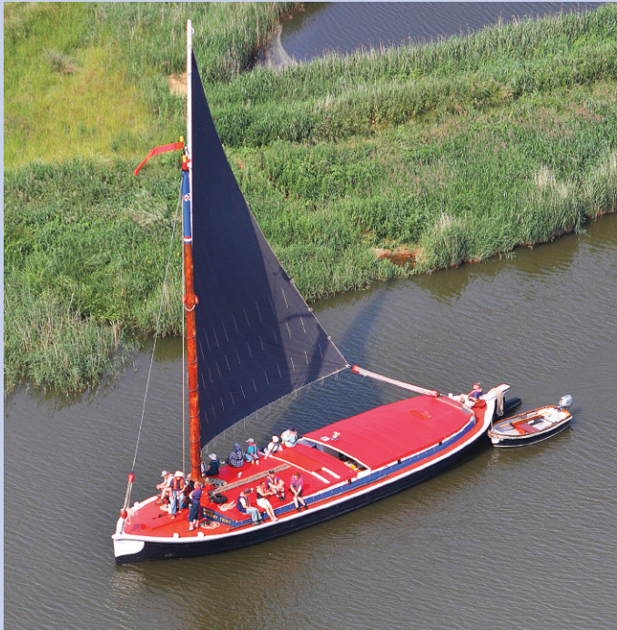
Wherry Albion – ‘the last of the trading wherries’