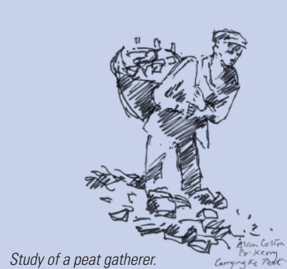
Study of a peat gatherer.