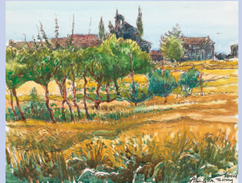
Below: Pen drawing with watercolour at the village of Strove in Tuscany.