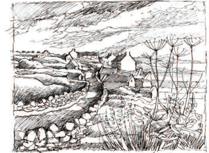
Cottages at Veniny Houborn, Co. Kerry. Alan Cotton Jan 2000 prepared size 36" x 40". Enslaving painting - brilliant light from R.H. side deep cast shadows continuing into lower golden fields large foreground plants, by scale contrasts creating a feeling of great depth in the painting.