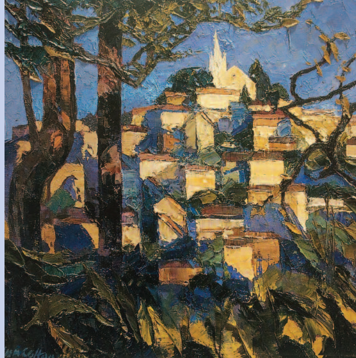
Bonnieux through trees.