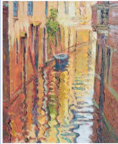
View from the window of Alan Cotton's Venice studio.