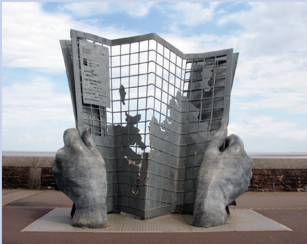
South West Coast Path marker at Minehead.