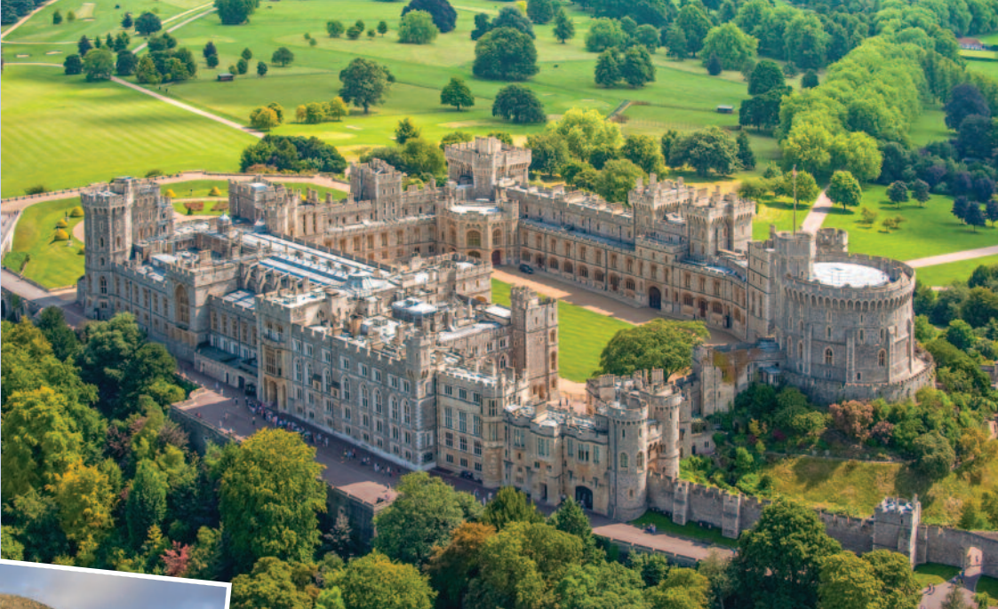
Above: Aerial panorama of the State Apartments and the Quadrangle in the Upper Ward, Windsor Castle.