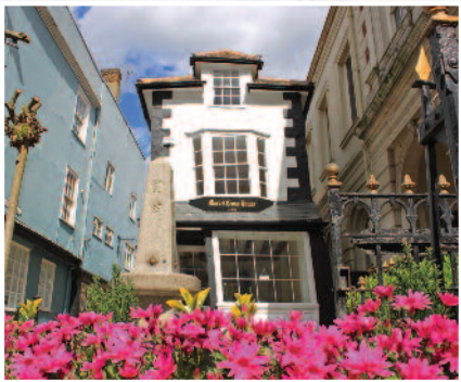
The Crooked House, one of the most photographed buildings in Windsor, with a bevy of pink flowers in the foreground.