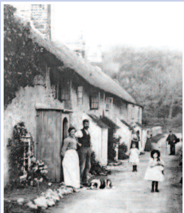
These few remaining cottages along Butter Street are vestiges of Fleet Village devastated in the Great Storm of 1824.

Below: The German Ketch Alioth aground in May 1923 after the captain declined an offer by a local steam tug to tow her out of the harbour and clear of land.