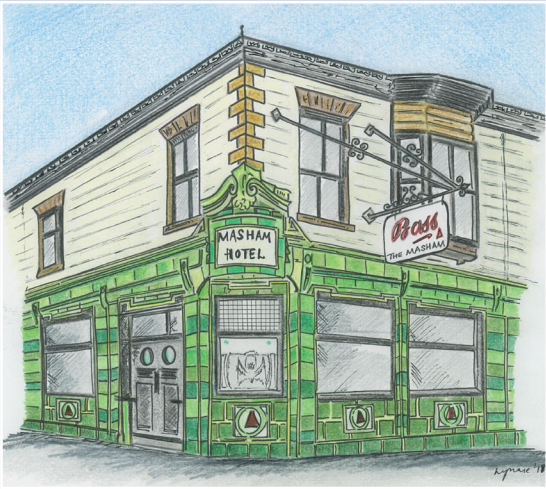
'Above: The Masham Hotel' by Lynne@SmoggieArt © 2020 SmoggieArt