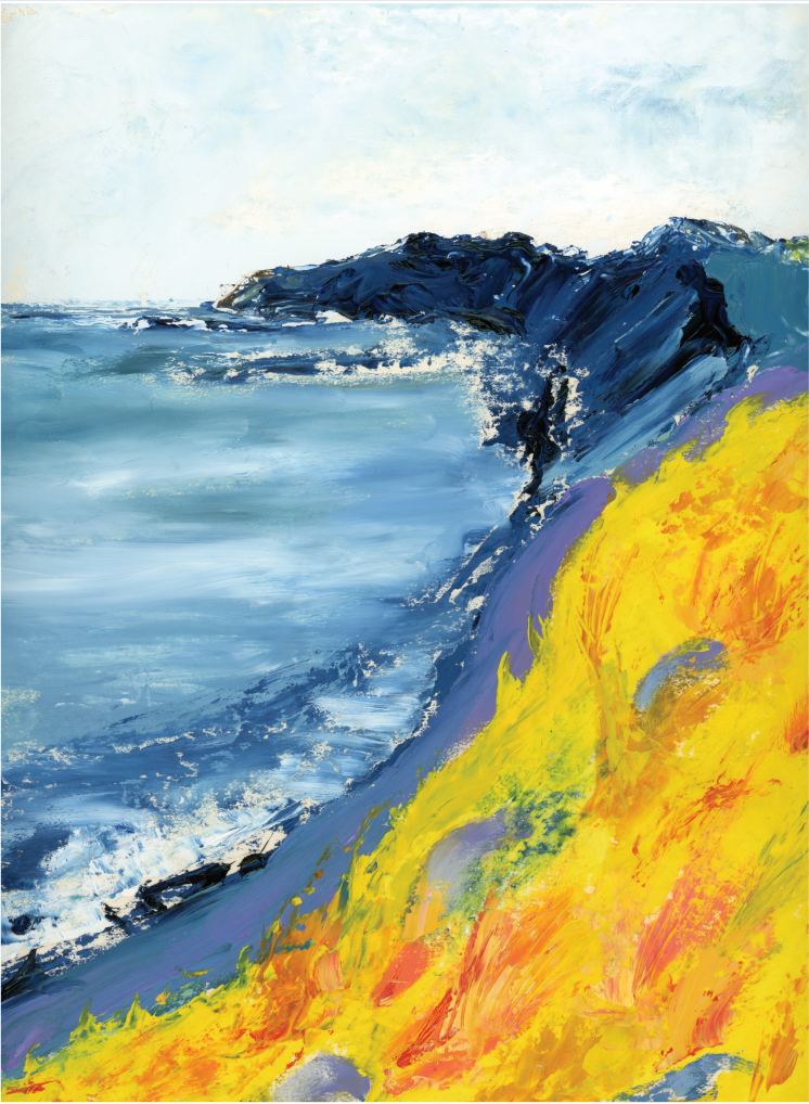
Above: 'Kettleness Scar VII' by Kay Spare © 2020 Kay Spare