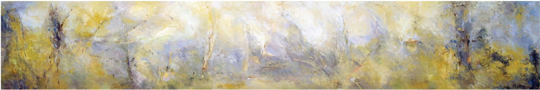
Above: 'Adaptive Measures III' by Lindsay Mullen © 2020 Lindsay Mullen