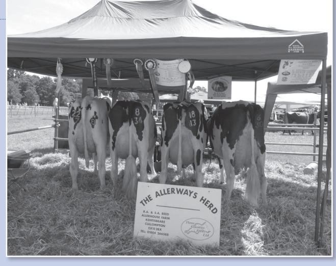
Above: Daughter and son-in-law – the Allerways Herd.