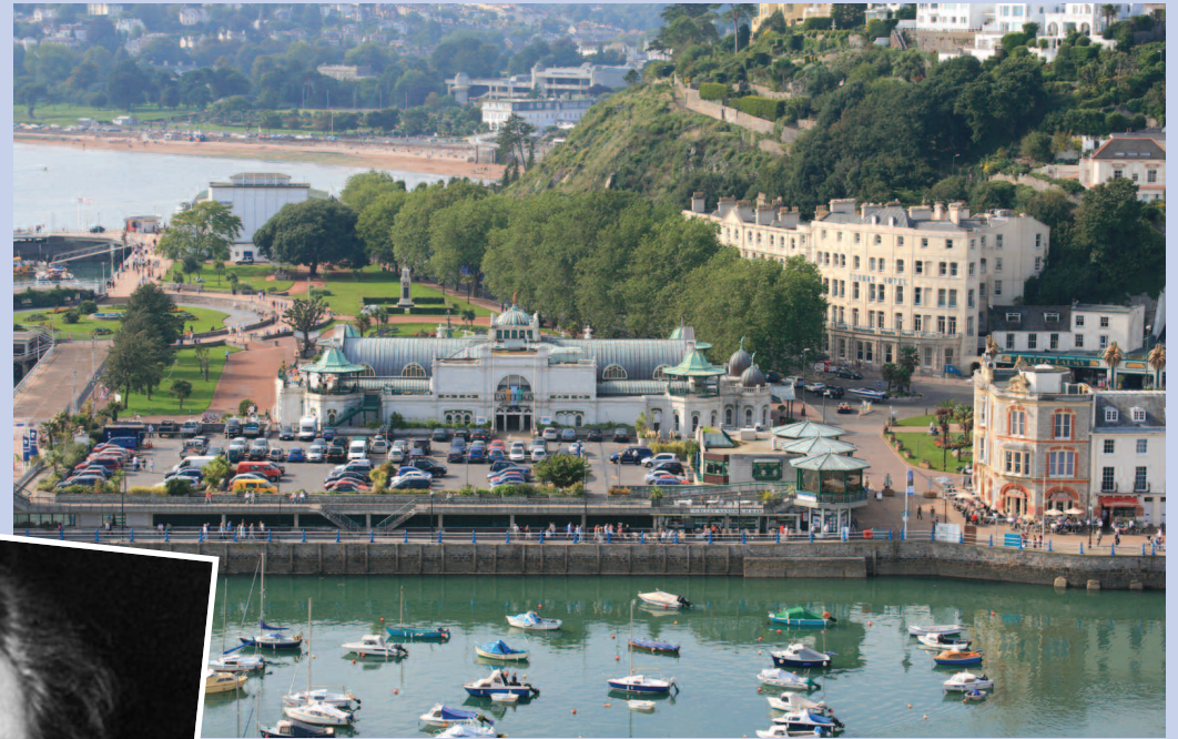
Above: The Pavilion from Vane Hill.