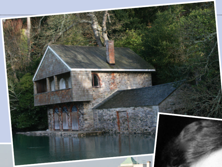
The Boathouse at high tide.